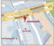
..... 152 Harley Street