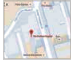
..... The Portland Hospital