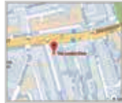
..... The London Clinic