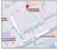
..... Great Ormond Street Hospital